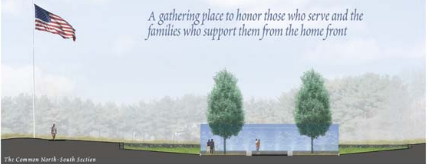
The Common North-South Section

A gathering place to honor those who serve and the families who support them from the home front